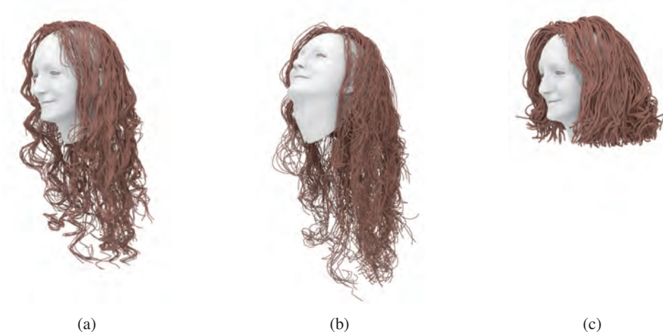
Figure 3: Real curly wig (a) captured from [11], inverted by our method in [6] and physically animated (b) and trimmed (c).

In the presence of contact and friction, Coulomb sticking constraints have to be considered, which makes the overall inverse problem nonsmooth and ill-posed. We have shown that assuming known mass and stiffness and a simplified inverse model, it is possible to recover a plausible natural shape as well as frictional contact forces at play [6]. This work allowed us, for the first time, to animate in a plausible way a few hair geometries stemming from recent hair captures (see figure 3).