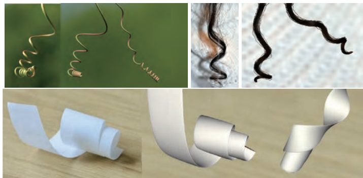
Figure 1: Many physical strands exhibit a smooth curled geometry with linear-like curvature profile, which is captured and deformed accurately thanks to our super-clothoid model [4]. From left to right and top to bottom, three examples of real strands whose shapes are synthesized and virtually deformed in real-time using a very low number of 3D clothoidal elements: a vine tendril (4 elements), a hair ringlet (2 elements), and a curled paper ribbon (1 single element).

classical integration methods [4]. The key of our approach was to leverage the form of the solution as a power series expansion, while avoiding the pitfall of catastrophic cancellation through an adaptive integration strategy. With this tool in hand, we were able to demonstrate that the super-clothoid model could capture intricate shapes both robustly and efficiently, with better spatial accuracy and geometric fairness compared to state-of-the-art methods (see figure 1).